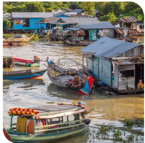
Tonle Sap Lake